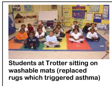
Students at Trotter sitting on washable mats (replaced rugs which triggered asthma)

Is there any advice you would share with teachers/staff who are trying to get their school on board to adopt some of the strategies being used at the Trotter? People need to work together. I think we were able to accomplish a lot because there was not a lot of blaming going on. My principal was very open to letting "outsiders" in on the process. She also recognized the importance of getting our students asthma under better control. Working closely with the custodians understanding the Pest Control/IMP process key to controlling the mouse problem.